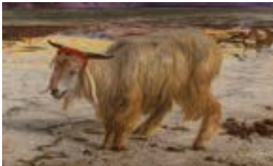
The scapegoat, an important element of the ancient Day of Atonement

But whoso looketh into the perfect law of liberty, and continueth therein, he being not a forgetful hearer, but a doer of the work, this man shall be blessed in his deed...So speak ye, and so do, as they that shall be judged by the law of liberty.