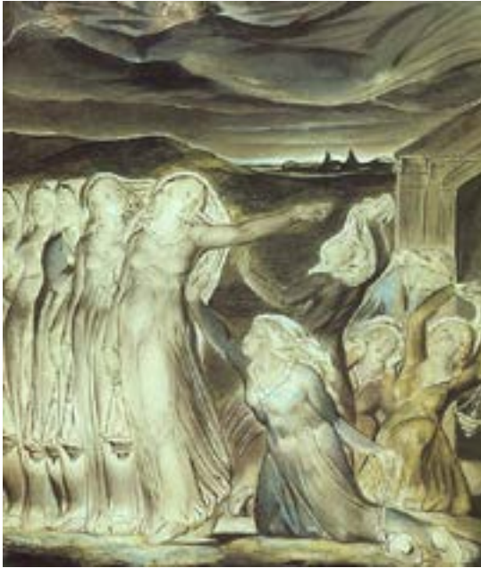
The Parable of the Wise and Foolish Virgins by William Blake, 1822

2) In the parable of the ten virgins, what does the oil signify, and why couldn't those who had enough share with those who did not? (00:03:10)