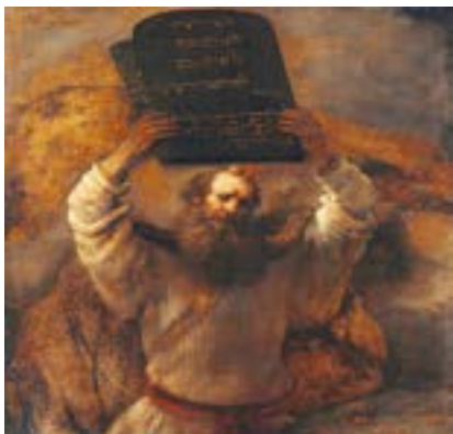
Moses with the Ten Commandments by Rembrandt, 1659

14) Fill in the blanks of the verse below to determine some of the characteristics of God's law.