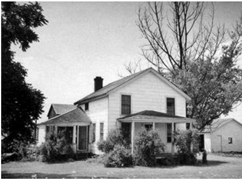
The home in Otsego, Michigan, where Ellen G. White had her Health Reform vision in 1863.