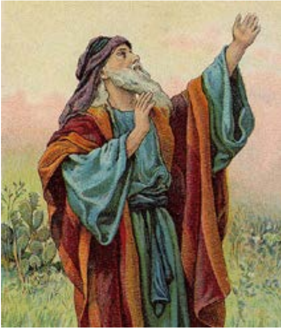
A depiction of the Biblical prophet Isaiah

5) What does the Bible teach in regard to our attitude towards prophecy (see 1 Thessalonians 5:21, Matthew 24:24)?