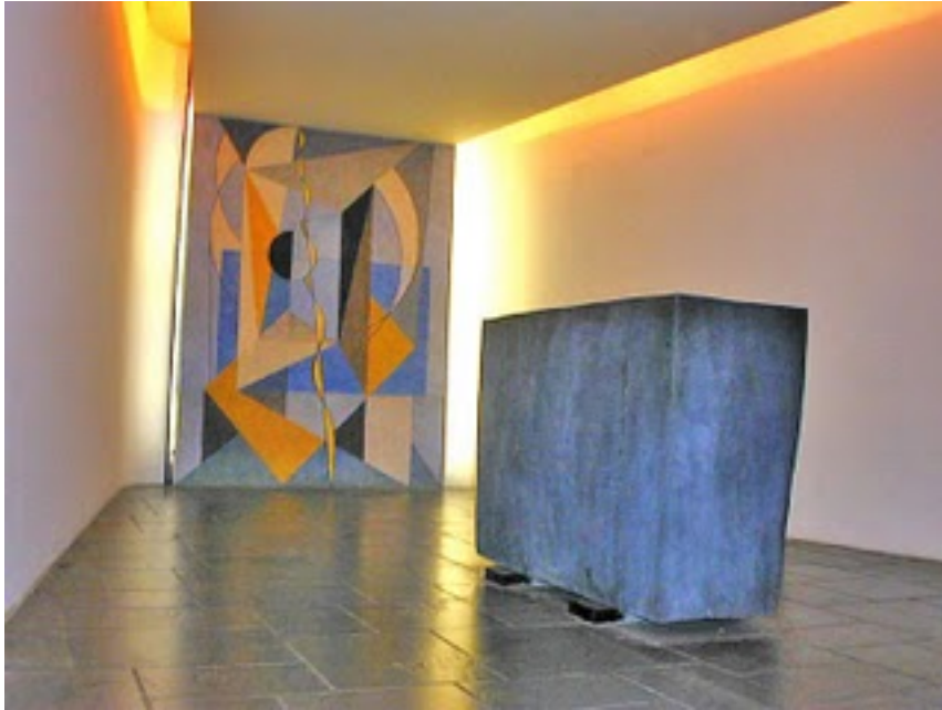
The United Nations Meditation Room.

The main features of the Meditation Room are its trapezoidal shape, its lighting, and its decoration: a mural and a large block of iron. Texe Marrs explains the occult nature of these features: