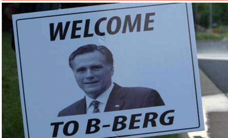
A banner welcomes Republican presidential nominee Mitt Romney to the 2012 Bilderberg conference.

What a Bilderberg it's been. Big names, big money, big decisions, big crowds. Somewhere around 800 activists outside the gates (up from about a dozen in 2009), and inside? Well, here's what we learned.