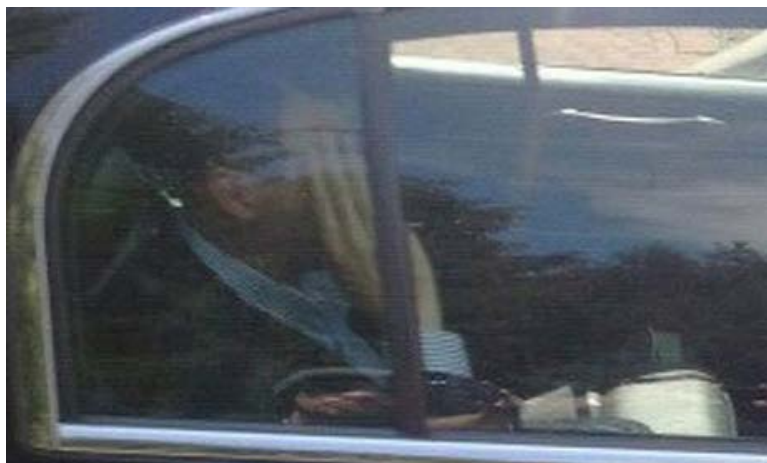
Bill Gates's ear (probably) leaves Bilderberg.

The Washington Post saw Bill Gates come in. And I've got three eyewitnesses from inside who confirmed he was here. This is his ear: