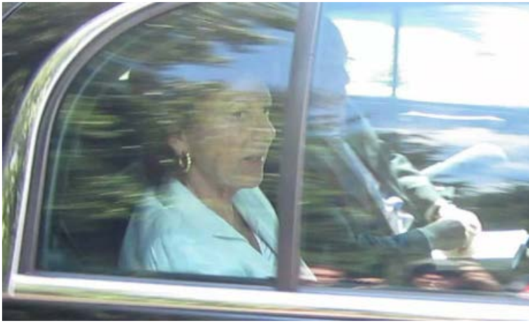
Neelie Kroes, EU commissioner.

There was speculation before the conference that on the Bilderberg agenda this year would be how to implement a unique EU internet ID. Who would be pushing that through? Step up Neelie Kroes, EU commissioner for digital agenda.